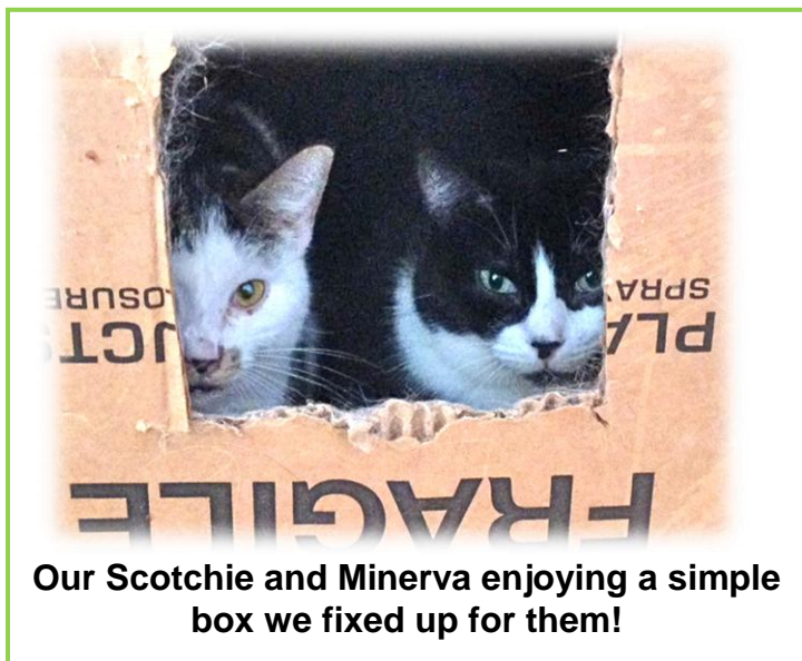
Our Scotchie and Minerva enjoying a simple box we fixed up for them!

The winter out here was relatively uneventful. Our automatic whole-house generator refused to perform its weekly check cycle one day so I phoned the company who sold and installed it to have it fixed. We learned that the extreme cold was preventing it from going on. As a result we had to buy a special $400 insulated cover for the generator so that extreme cold wouldn't affect its operation.